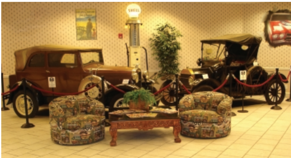
One of the most famous roads in American history is Route 66. The Route 66 Hotel and Conference Center in Springfield, Illinois, is the oldest hotel in Illinois along this famous thoroughway. It sports 114 rooms, a memorabilia museum, and closeness to attractions such as the Abraham Lincoln Presidential Library and Museum. ROUTE 66 HOTEL.

The resort can accommodate two motorcoach groups at one time, and their parking lot has bus access for up to six coaches. Driver and escort are complimentary guests with a minimum of 40 paying passengers. Group rates for all-inclusive group packages start at $68 per person (U.S. funds). Reservations