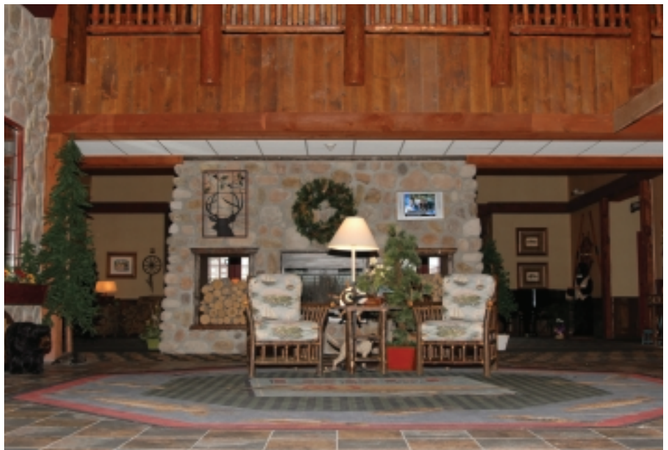
The Quad Cities newest hotel opened its doors in 2005. Since then, Stoney Creek has been hosting groups with 140 rooms in the heart of downtown Moline. Come relax and enjoy a stay in the great North Woods, or as close as you can get without being there. STONEY CREEK INN.

Located on the east edge of Galena’s National Register Historic District, The Irish