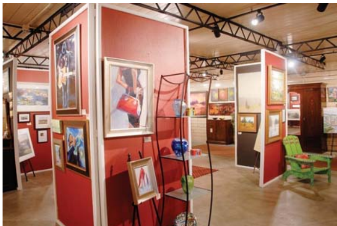
Learn more about local history and artists just across the hotel's parking lot at Stafford's Gallery of Art and History.